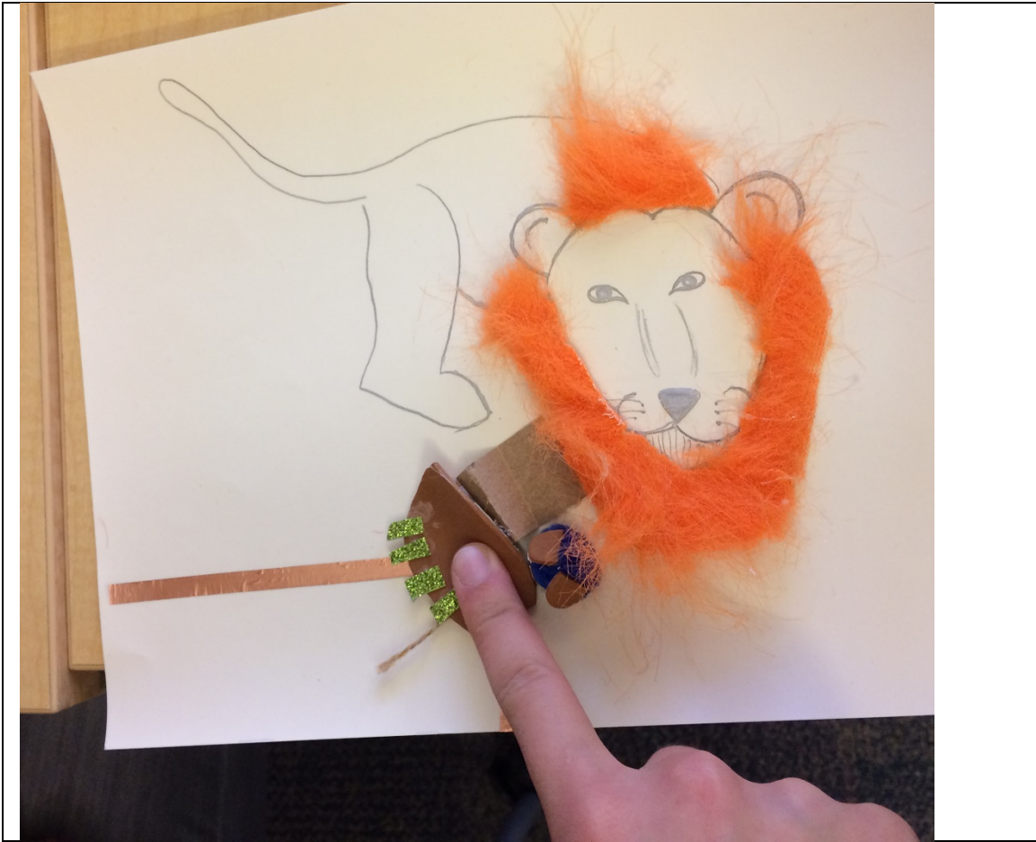
Figure 1. Crafting a tactile retelling of the fable, The Lion and the Mouse, this student is testing the sound button which will play the Lion's dialogue when connected to Makey Makey and Scratch. Rough glitter paper accentuates the claws and soft yarn expresses the lion's mane.